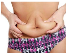
5 Veggies That "Destroy" Stomach Fat