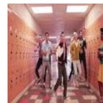
VIDEO: Todrick Hall, Joseph Gordon-Levitt Star in 'Hairspray/Grease' Musical Number