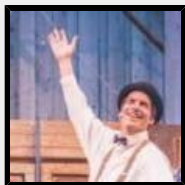
Musical World Premiere Opens Northern Sky's 25th Season