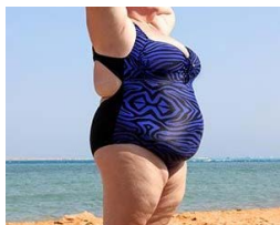
How Older Women Are Losing Weight