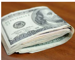
Tricks Car Insurance Agents Don't Want You to Know