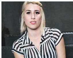
Ever Googled Yourself? This Site Reveals All, Take a Look