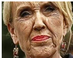
Divorced for Being "Too Old!" See Her Revenge Makeover