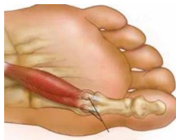
#1 Predictor of Diabetic Amputation