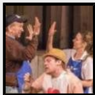
NO BONES ABOUT IT Fuels Romantic Comedy at Northern Sky