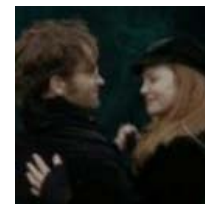
Harry Potter's Parents to Take Center Stage in New West End Play