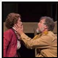
Shakespeare's Summer Magic Blooms in APT's MERRY WIVES OF WINDSOR