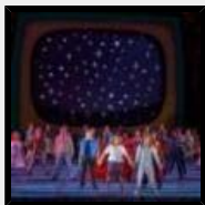
Top 10 Around the World: HAIRSPRAY at The Mundy, ILLUSIONISTS & More!