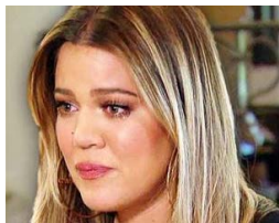
The Entire Family's Reaction to the Unrecognizable Change