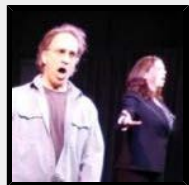
TAP & Riverway Studio Present Heartwarming Premiere "Guide to Online Dating"